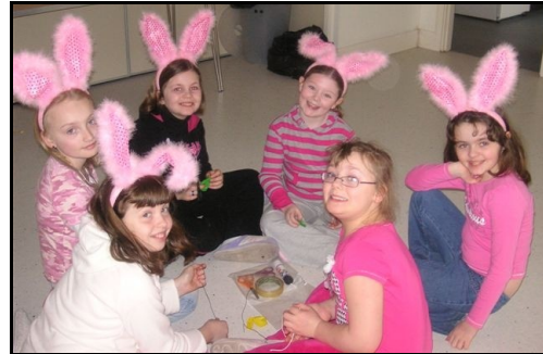
Bantaskin Brownies & Guides enjoying an Easter weekend at Netherurd