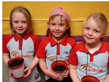
1 st Denny Rainbows plant their sunflower seeds!